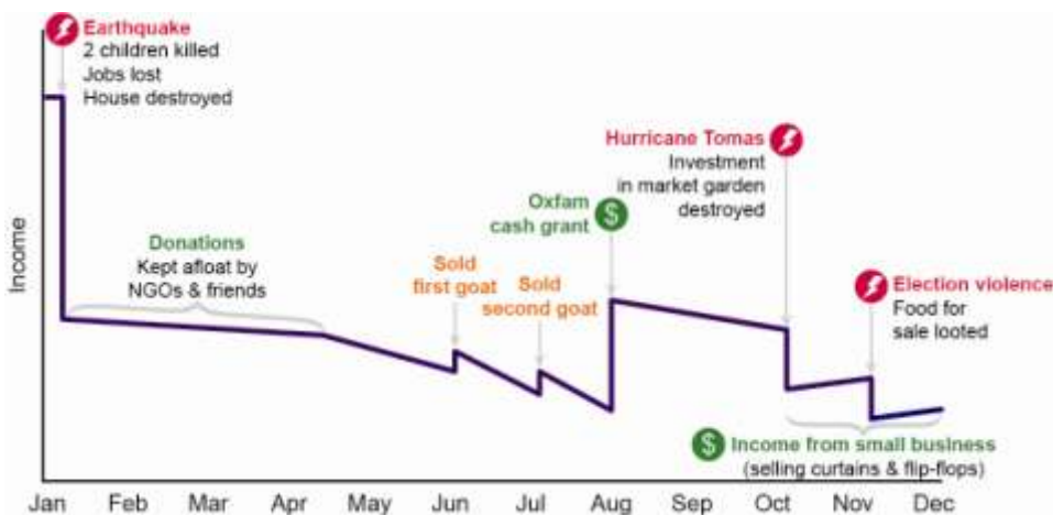
Figure 1: One family's experience after the 2010 Haiti earthquake