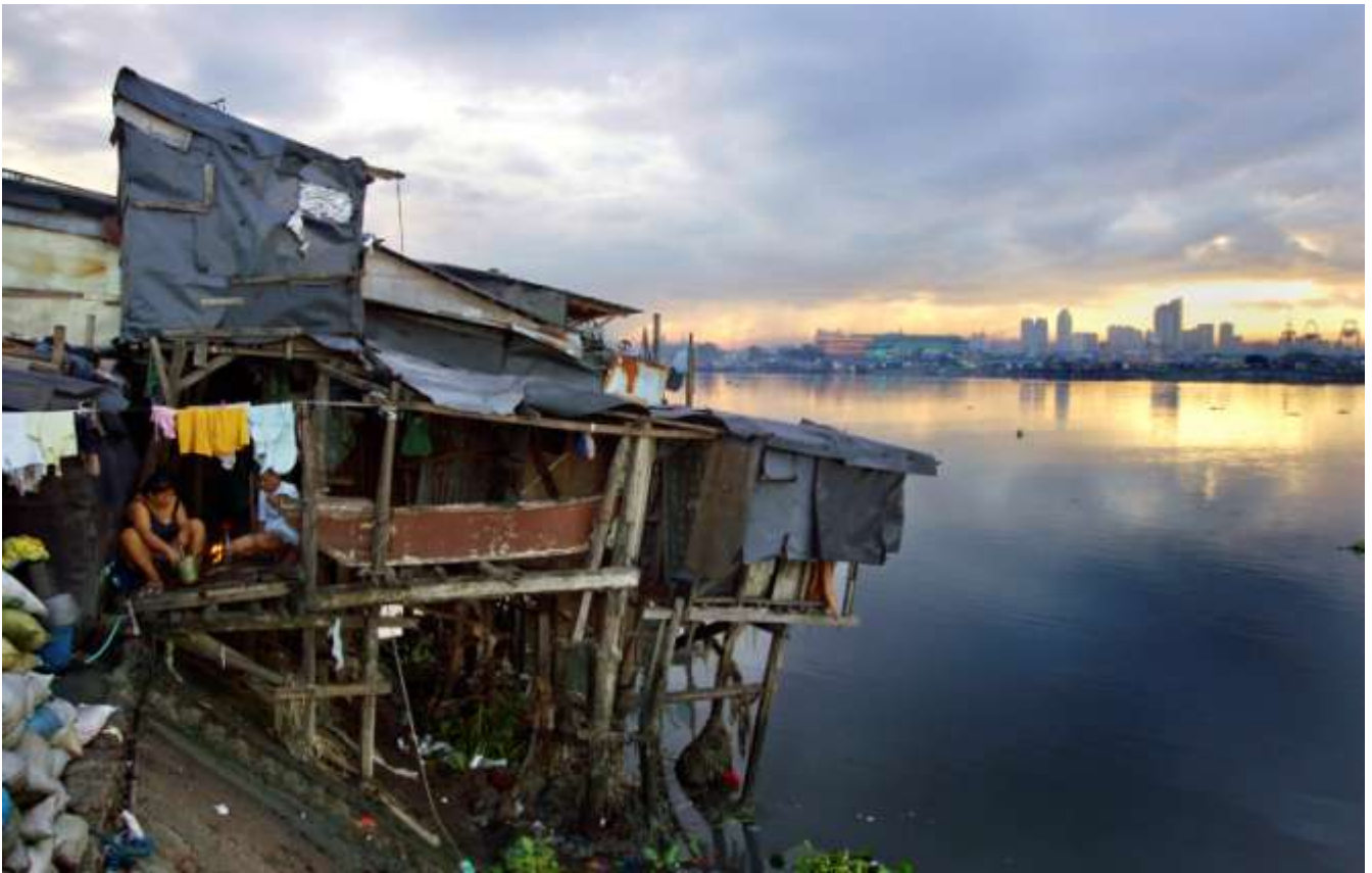
People in a waterside house raised on stilts in a slum in Manila.