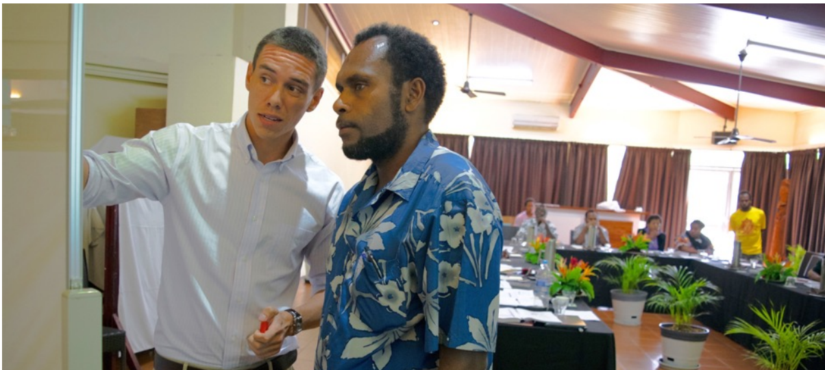
Pictured above: Interim VCAP PIU Staff discussing development plans w Area Secretary of Aniwa Area Council

Meetings were conducted with these numerous national stakeholders in order to fully apprise and inform senior officials regarding progress to date by VCAP Interim PIU and to inform these valued stakeholders of plans for VCAP Inception Week. These briefings allowed for participating agencies to prepare as required in order to successfully take part in the planning process and provide relevant input into the proposed Annual Work Plan and Budget for 2015.