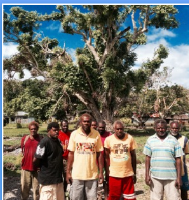
Above: Villagers gathered in Pongkovo Village, Epi island during Site Coordinator recruitment mission.