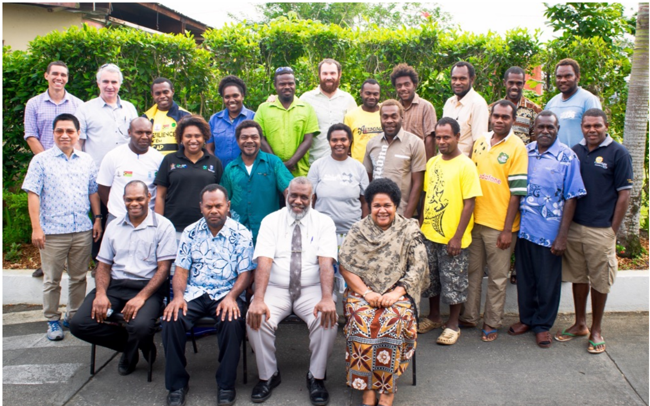
(Participants of VCAP Inception week during June 15-18, 2015 in Port Vila)