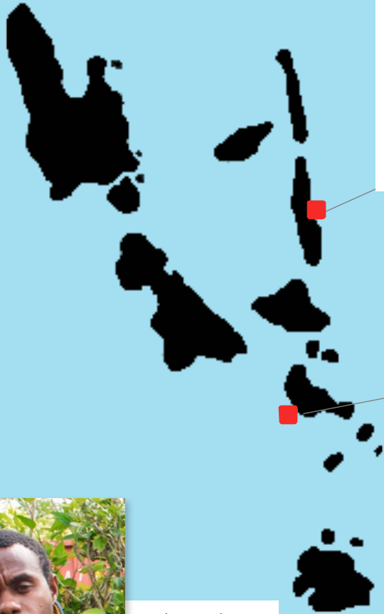
Sergio Tabi PENTECOST, Savat Village Village Youth Committee Secretary, Carpenter

Selected by VCAP Interim PIU to support VCAP implementation for at least 1 year, they participated in VCAP Inception Week activities.