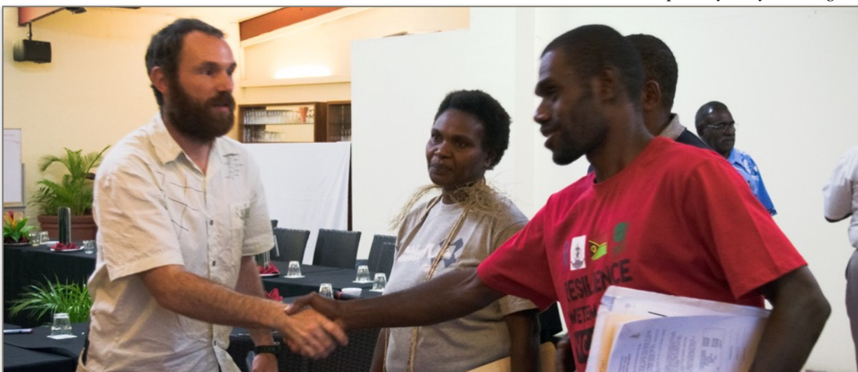
Picture above: VCAP Interim PIU staff and participants from VCAP Inception Week