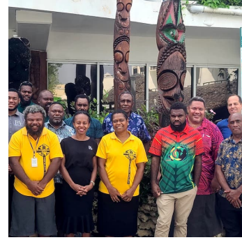
Photos from the workshop – click on any image to download high resolution images

[CORRECTION: an earlier version of this media release incorrectly attributed CSIRO as the partner developing the ClimateWatch app. This has been corrected below Australia's Bureau of Meteorology].