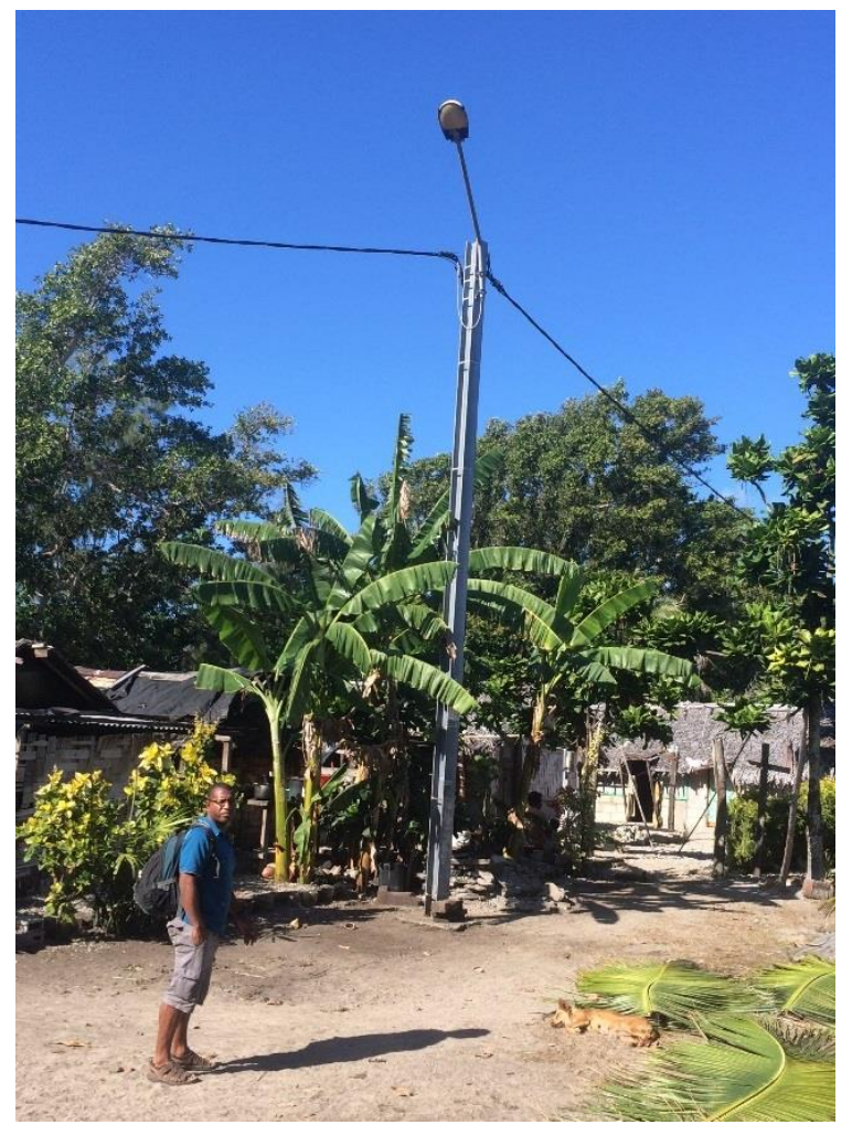
Figure 3 Power Pole and Distribution Lines