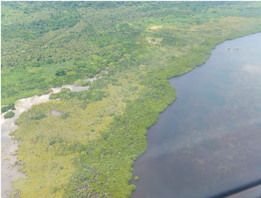
Figure 3. Mangroves in the Port Stanley/Crab Bay area

compiled digitally by Vanuatu's Forestry Dept, which was lost due to hardware failure), whilst other data do not make differentiation between mangrove species possible, thus limiting their value and use (Molu Bulu MESCAL pers.com. 2013). Accordingly areas that have been the focus of MESCAL demonstration sites (Figure 2) are now increasingly better mapped, whereas areas of mangroves on other islands are still somewhat less well understood.