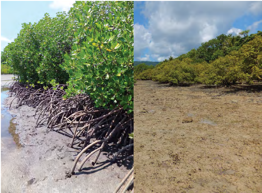
Figure 5. Mangrove stands on Malekula showing differences in underlying substrate and hence carbon sequestration and sink potential – deep sediment system (left) and mangroves growing on ancient coral platform with little sediment (right).

Being a country composed of islands with the community's close associations to the sea, but also one assessed as being of the greatest exposure to natural risks, it is important to maximise the contribution natural ecosystems can bring to the nation's overall wellbeing. Thus having blue carbon habitats present and mainly in a natural state provides an excellent basis to proceed with blue carbon work. This is especially the case given previous work that provides, at least for mangroves, a good understanding of the resource and issues on which to base future work. The fact that Vanuatu has already become the regional leader on promoting blue carbon both within the region, and to international fora such as Rio + 20, demonstrates the high level of political commitment to recognise blue carbon and follow through on future actions.